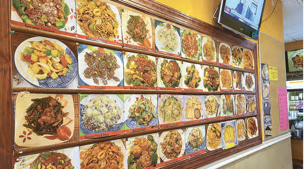
A wall of colorful dishes at Eastern Restaurant.

The noodle soup over at the Viet House is "known for the aromas, clean broth," said the manager. It's a good food in the cold weather and many have it "when they're SEE FOOD OFFERINGS. PAGE 8