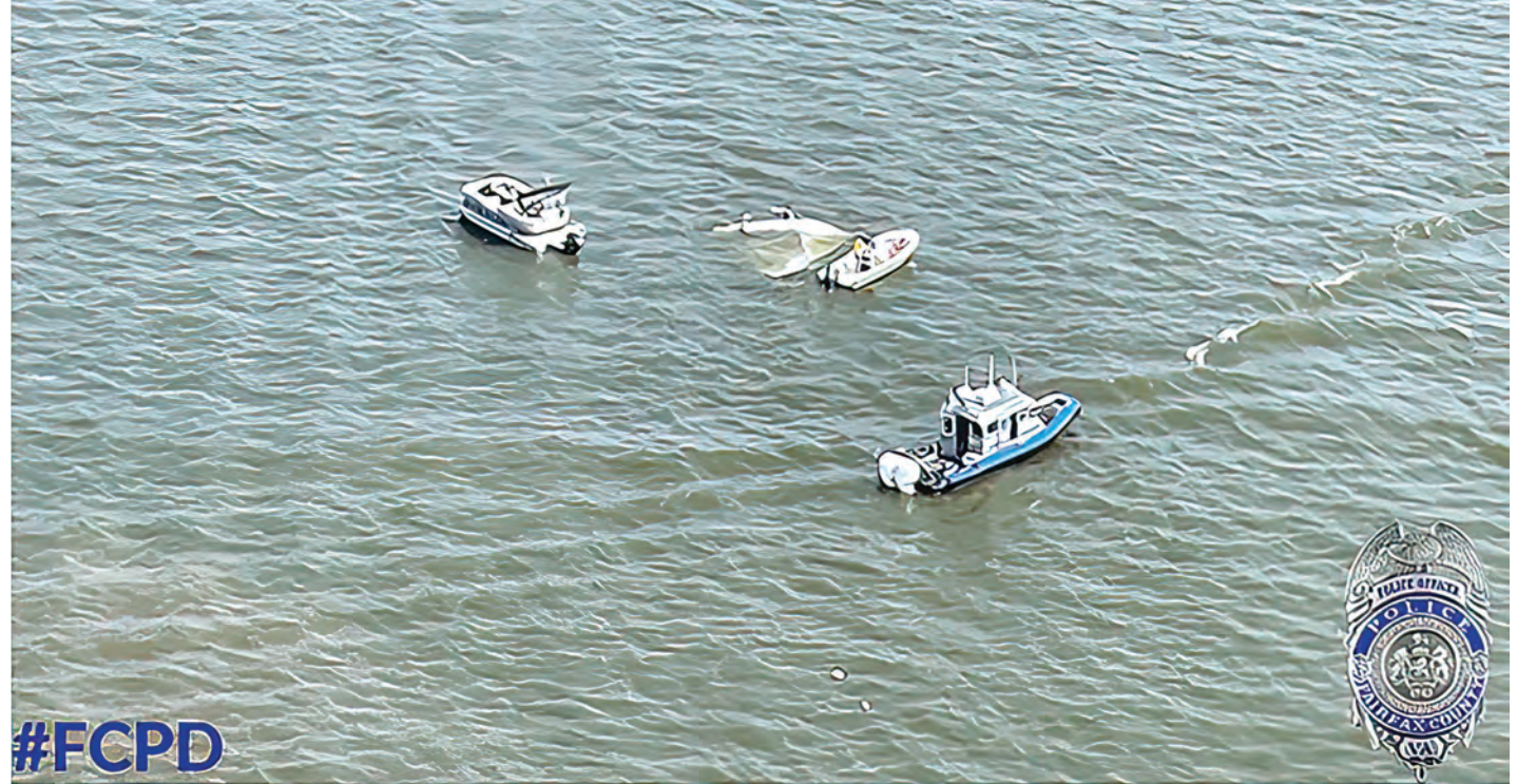
Fairfax County Marine Patrol Unit responds to a boat mishap in the Potomac River.

The boat involved was boat 16 owned by the marina. It was back in working order in a day or so.