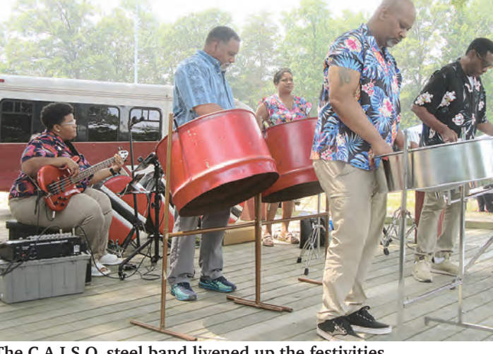
The C.A.I.S.O. steel band livened up the festivities.

6 ♦ Mount Vernon Gazette ♦ June 22-28, 2023