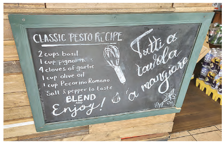
A Maggio's Italiano, the pesto recipe is shared with all the patrons.