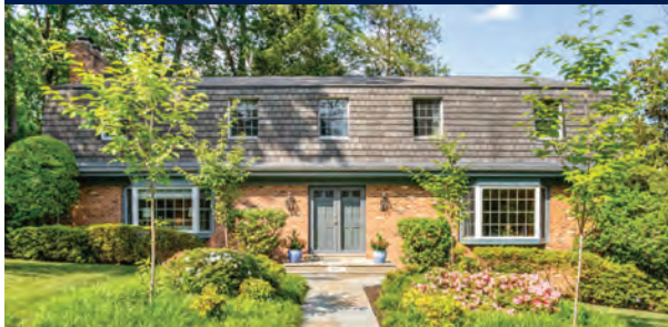
Mason Hill | $1,150,000

Stop by Sunday from 2-4PM to see this beautiful 5-bedroom, 3.5-bath Colonial. The gracious, lightfilled home with elegant appointments will please the most discerning buyer. 1900 Windmill Lane www.MaryTaylorRealtor.com