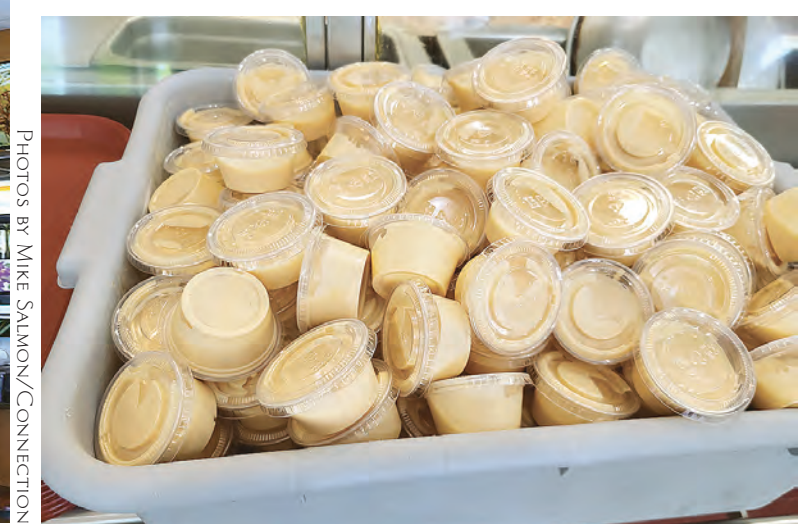
The 'yum yum' sauce is all stocked up at Sarku.